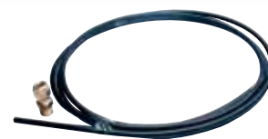
Oil line kit 230.012