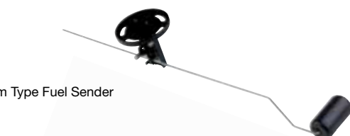
Arm Type Fuel Sender