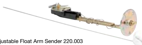
Adjustable Float Arm Sender 220.003