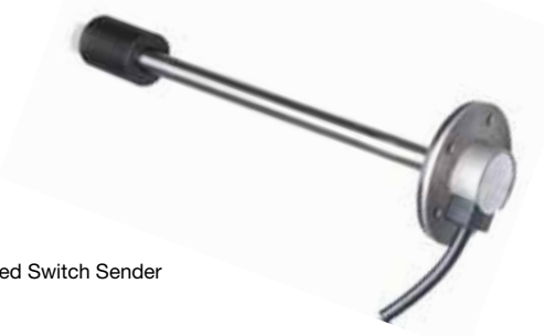
Reed Switch Sender