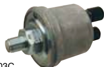
Sender 360 081 038 003C